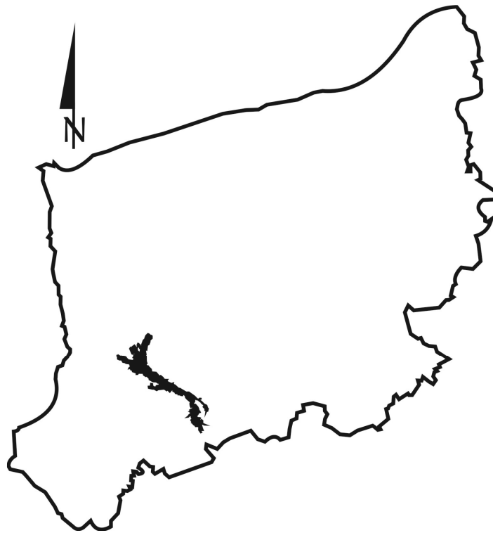
Fig. 1. Localization of the Dolina Płoni i Jezioro Miedwie (Płonia Valley and Miedwie Lake) Special Area of Conservation in West Pomeranian Voivodeship

Rys. 1. Lokalizacja obszaru Natura 2000 Dolina Płoni i Jezioro Miedwie w województwie zachodniopomorskim